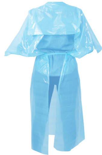
OPEN BACK DESIGN